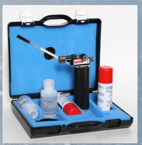
FB 25 set with primer and handling

The surface activation due to the PYROSIL® coating lasts (in dry air and at temperatures between 22 °C and 25 °C) several weeks. A fast-subsequent treatment within 30 minutes (maximum 12 hours), e. g. an increase of the adhesive abbilities with SURALink primer pre treatment, is recommended.