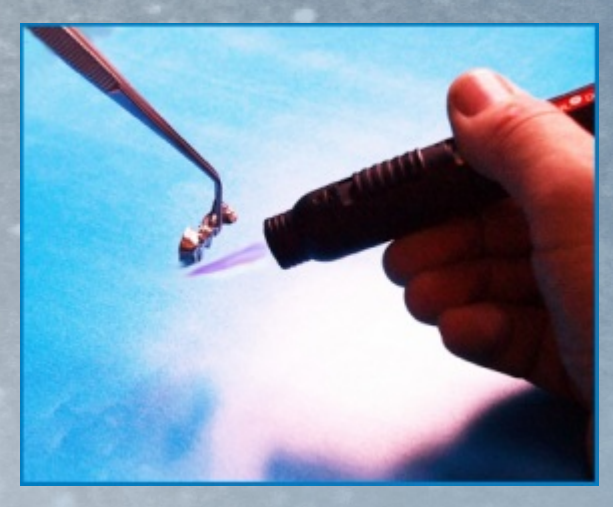
FB 07 (pen) in use Device for hand flaming